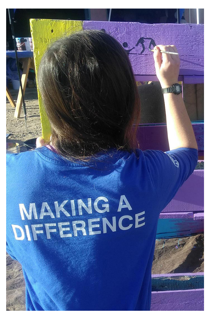
Sage Intacct's multi-dimensional general ledger is key for Rocky Mountain Youth Corps to accurately tracking expenses.